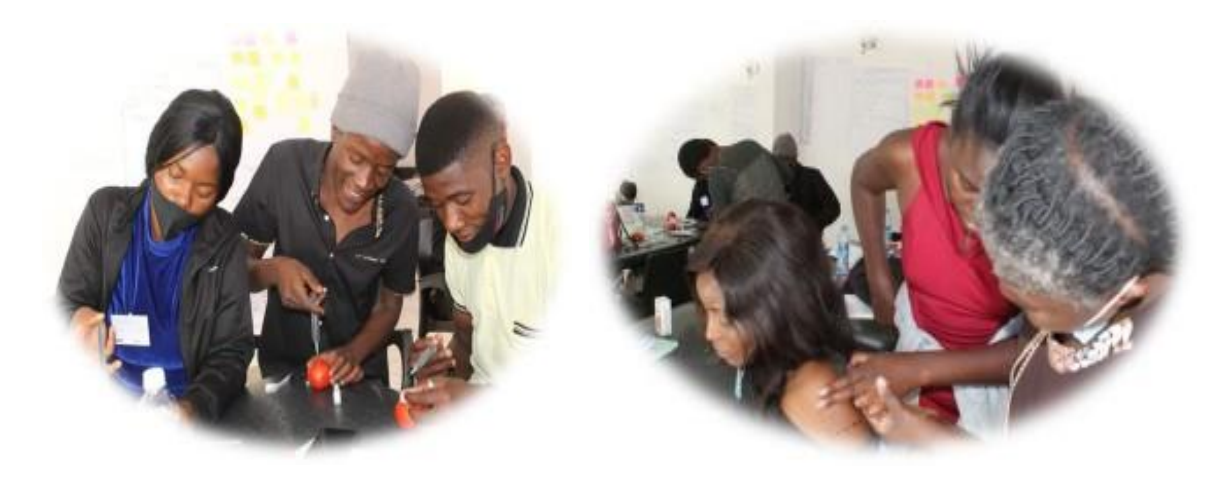
FIGURE 3. YOUNG PEOPLE LEARNING THE INJECTING TECHNIQUE USING TOMATOES FIGURE 4. CBds learning how to locate the position for injection in the ARM

On the final day of the training, all trained CBDs exhibited competence and were awarded with certificates. Furthermore, for the CBDs to gain more practical knowledge, all of them were attached to their facilities for a period of one month to gain experience before they began delivering contraceptives in the communities.